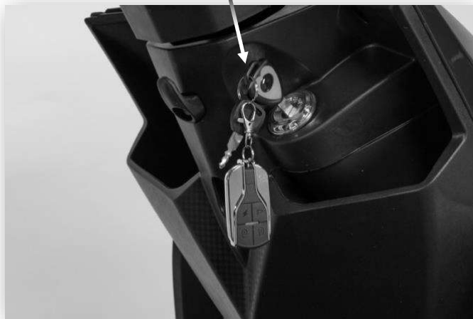
Insert Key into Ignition