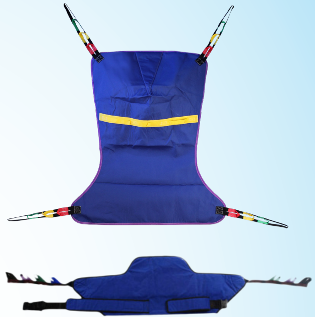
Stand Assist Sling