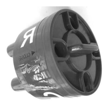
Fig. 1 Turn the dial to CLOSE position to inflate air mattress.