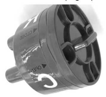
Fig. 2 Turn the dial to OPEN position to release air.

In the event of an emergency, turn the CPR valves to the OPEN position for fast deflation the air mattress. (Fig. 2)