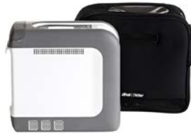
Carrying Case 125D-670