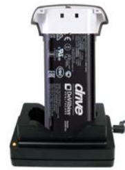
iGo2 Charging Station 125CH-613 (Battery not included)