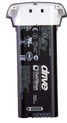
Spare Battery 125D-613