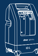
10 Liter Concentrator