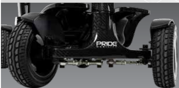
Pride's exclusive lightweight, non-scuffing tires