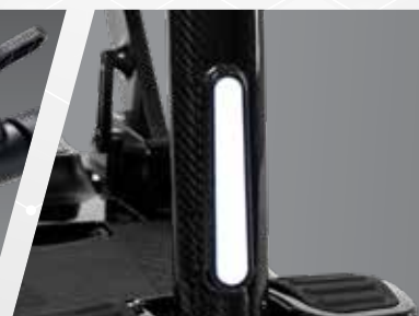
Enhanced LED light