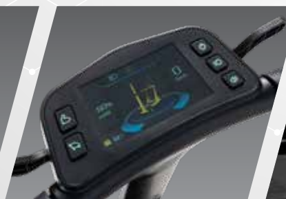
Vibrant full color display