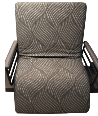
Assisted Chair Lift