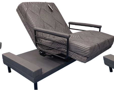
Head Up/Foot Up