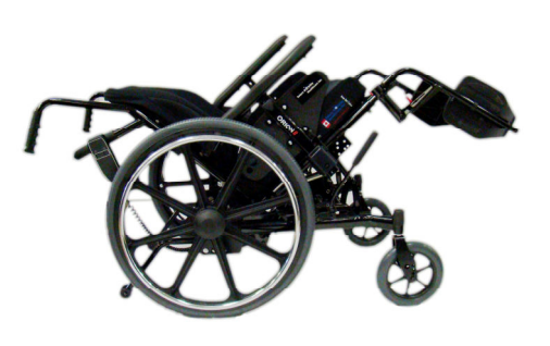
Chair in full tilt position