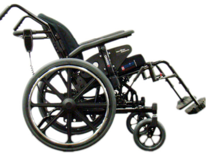
Chair in partial tilt position