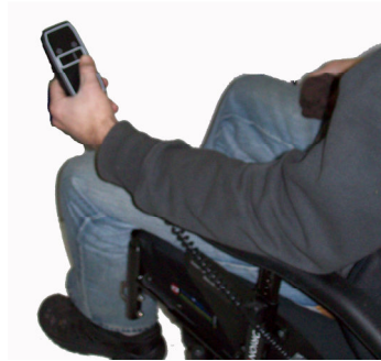
Chair tilted by occupant