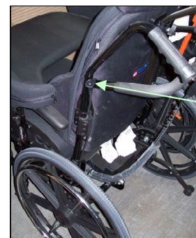
Cable extension for Battery/Control box (Item #15)