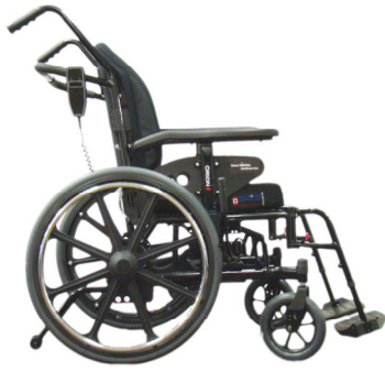
Chair in upright position