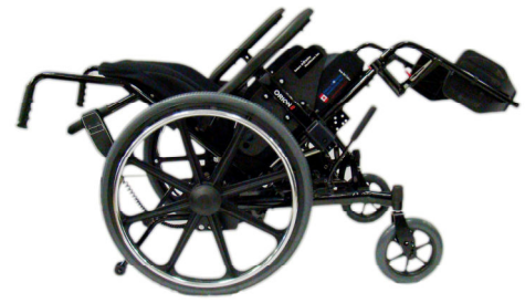
Chair in full tilt position