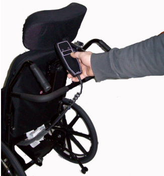
Chair tilted by attendant