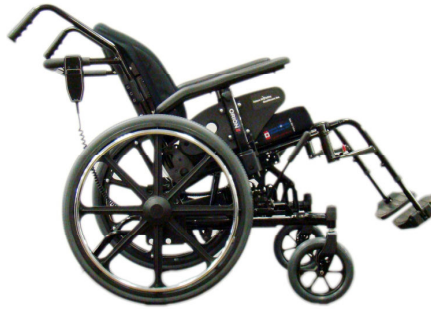
Chair in partial tilt position