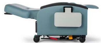
Multiple Positions for Enhanced Patient Comfort

Color variations may occur due to monitor or printer settings.