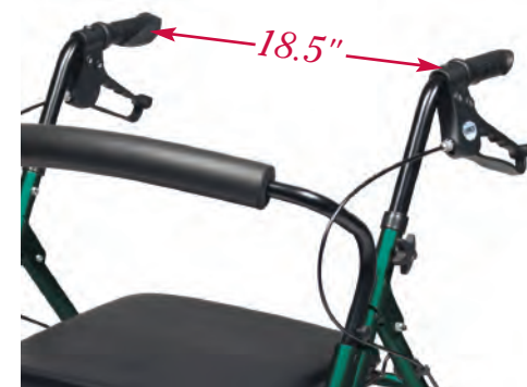
WIDE rollators offer 18.5" between handgrips and larger seats for added comfort

The Walkabout Deluxe ConTour rollators offer the same benefits as the Walkabout Lite rollator, while featuring a contoured padded backrest and heavy-duty 8" wheels that are ideal for both indoor and outdoor use. Also available is an add on adjustable backrest (RJ4805-ABAR) that allows the user to adjust the backrest for ideal positioning.