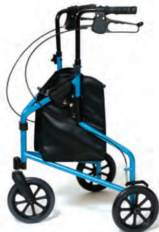
GF 3-Wheel Cruiser Item 609201