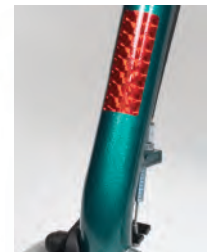
Rear Reflectors increase visibility at night!

This lightweight Walkabout Junior rollator is ideal for the petite or junior user. It is designed with a smaller frame, weighs only 12.5 lbs and has 6" wheels.