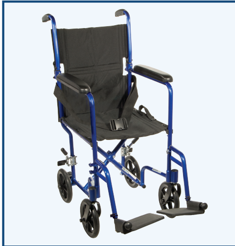
REF. ATC-BL Shown

It is important for the attendant to be familiar with proper assisting procedures in any situation that requires the use of the Transport Chair. Safety is the Key consideration. Consult your physician, nurse or physical therapist to determine methods most suitable for your individual needs and abilities.